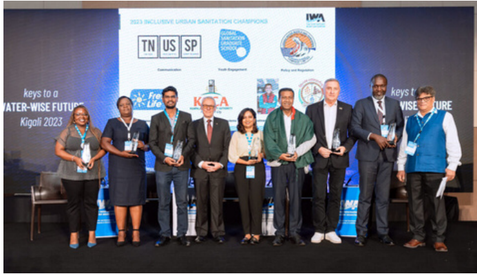
2023 Inclusive Urban Sanitation Champions

Sanitation was high on the week's agenda, reflecting IWA's push to secure progress through its Inclusive Urban Sanitation initiative and accompanying #SanitAction campaign. The High-Level Summit on Sanitation convened an influential audience focused on shaping the direction of policy. IWA's first Innovation Acceleration Forum , which ran in parallel to this, had a strong focus on practical solutions for sanitation, and a special #SanitAction Innovators Expo in the exhibition showcased emerging sanitation technologies from the Africa region. To further help promote progress on sanitation, one of the week's highlights was the announcement of IWA's first Inclusive Urban Sanitation 'Champions' – a group of outstanding, trailblazing practitioners.